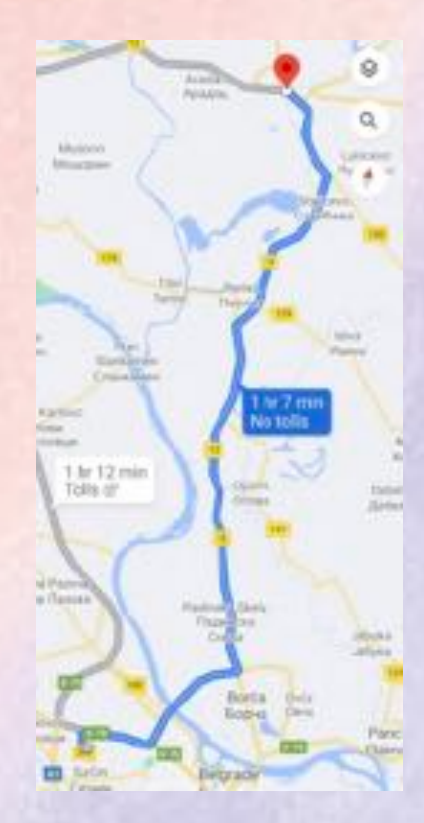
Belgrade airport "Nikola Tesla" LYBE is located 80 Km from the city of Zrenjanin.

Aradac field, municipality of Aradac, city of Zrenjanin, known for its rich history of aeronautical competitions.